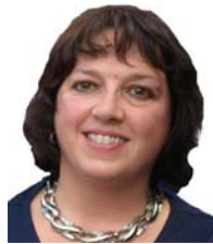
By Dawn deFuria