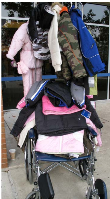
Some of coats donated to Operation Warm at Riddle Memorial Hospital event.

Delaware County's signature event to provide 5,000 children with new winter coats has been proving to be something people can feel good about. Individuals