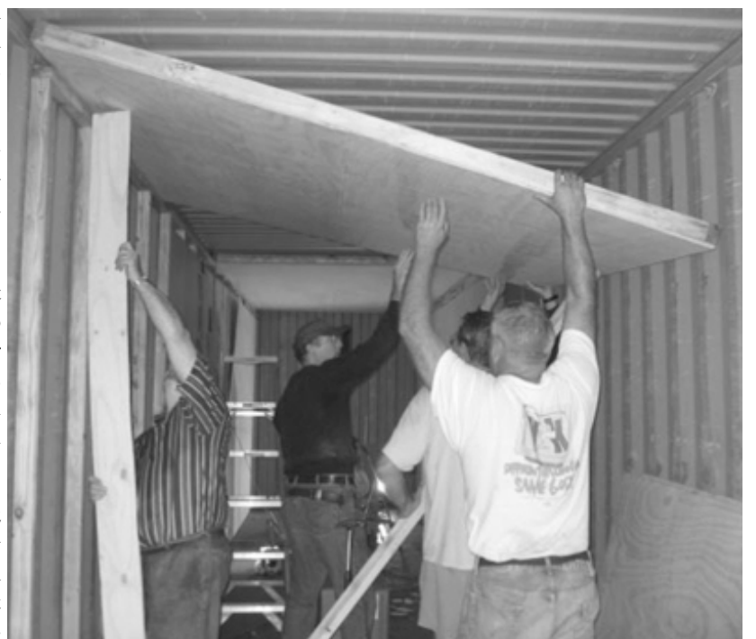
Volunteer workers install the ceiling in the container which will become the water filtration plant for Jos Nigeria.