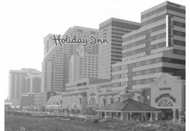
Holiday Inn in Atlantic City (arrow) is the site of the District 7450 Conference Oct. 27-29.