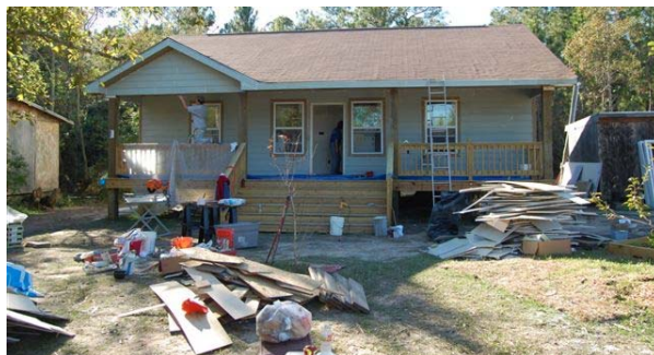
One of homes Rotarians are working on.