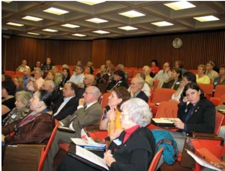
District 7450 Rotarians participate in RI Foundation workshop, one of two conducted at Delaware County Community College September 27. About 100 Rotarians attended the morning workshops on membership and RI Foundation conducted in two DCCC auditoriums.