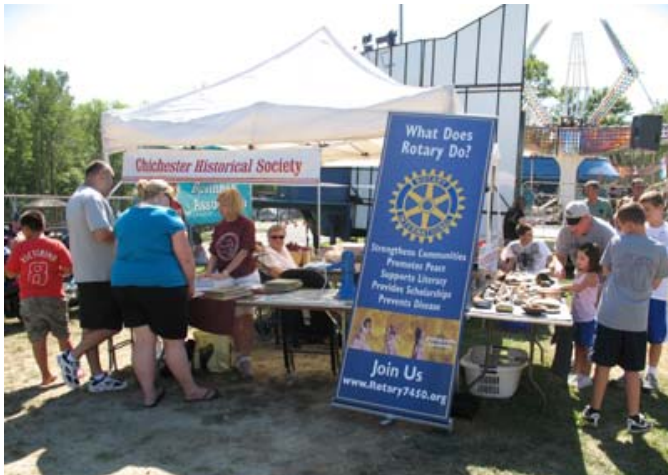
Chichester Rotary Club displayed the District Pop-Up at the Chichester Historic Society gathering .

Clubs are encouraged to consider purchasing a pop-up which can be customized for their specific programs and events.