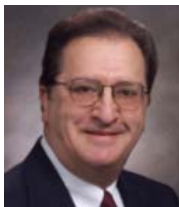
By Al Marland