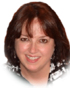
By Dawn deFuria