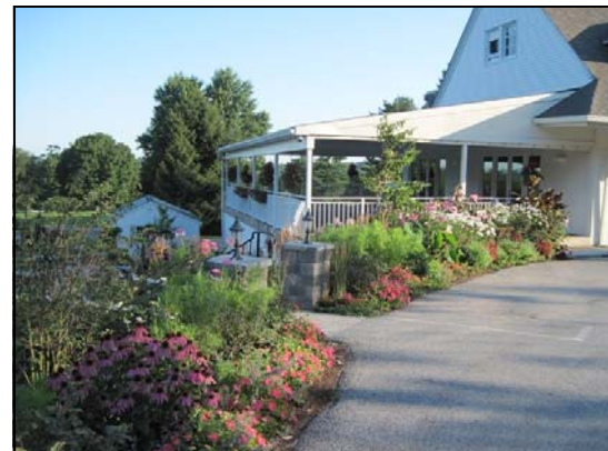
West Chester Golf and Country Club

We will be inducting our Assistant District Governors and making some special awards as well.