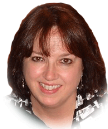
By Dawn deFuria