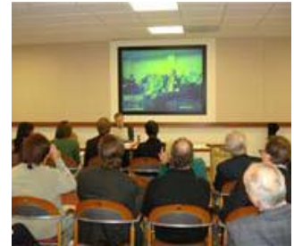
Philadelphia Rotarians participate in SKYPE videoconference with Rotary Club in Nottingham, UK February 10.