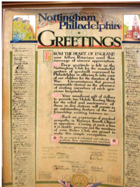
Letter of appreciation from Nottingham UK Rotary Club for help during World War II. . Circa 1940.