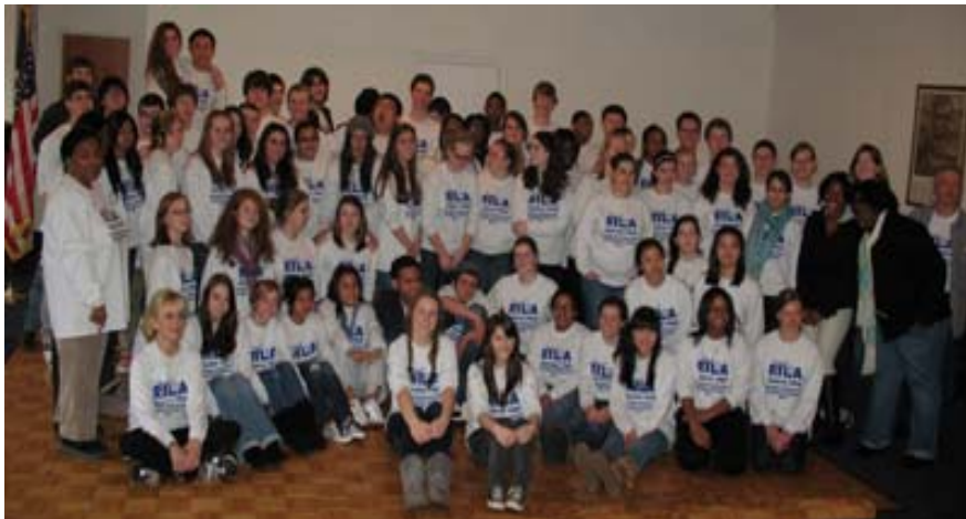
2011 RYLA participants gather prior to concluding program at Freedom’s Foundation at Valley Forge March 4 to 6.

There were many interactive sessions and small group activities as well as participation from area Rotaractors and District 7450 visiting exchange students, and a gala Talent Show.