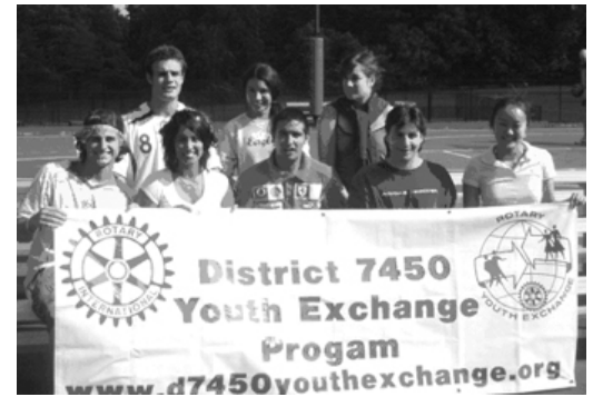
Youth Exchange Students bid farewell to each other at the Bon Voyage Picnic June 10 at the Upper Maine Line YMCA in Berwyn.

Rotary Districts 7430 and 7450 Membership Seminar is Saturday, Sept. 18, 2006 from 8 a.m. to 2:30 p.m. at Best Western Inn at Towamencin at the Lansdale Exit of the Northeast Extension of Pa. Turnpike. Plan now to share ideas, have fun, make new friends, discover solutions and participate in interactive exercises..